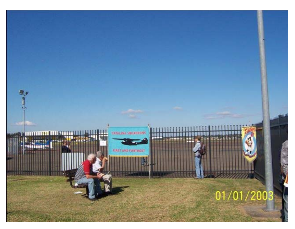
Catalina Squadrons banner